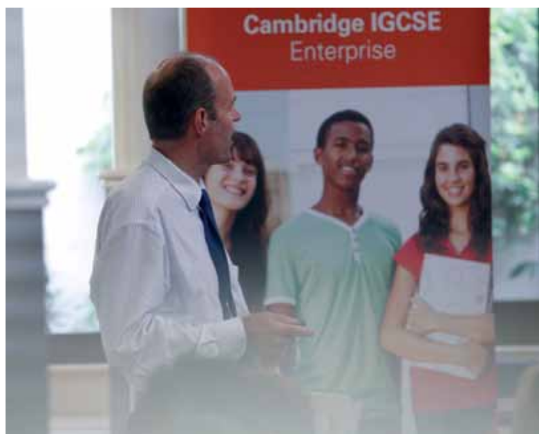
Cambridge IGCSE is the world's most popular international curriculum for 14–16 year olds.

A new partnership with the Institute of Career Guidance (ICG) reflects a shared commitment to the delivery of careers advice and guidance. Our UK exam board has launched three new Advice and Guidance qualifications