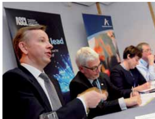
UK Education Secretary Michael Gove addressing the question, 'what do you think makes a good education?' at one of our events.

Building on our policy paper, our UK exam board established a series of strategic forums to forge closer relationships between qualifications stakeholders. The forums – which have been positively received by UK universities – were also designed to give institutions a strong mechanism for presenting their concerns and requirements to us.