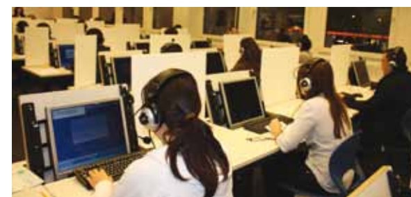
Students taking Cambridge ESOL tests at a computer-based test centre.

He said: "We're not trying to replace pen-and-paper testing. We're simply offering an alternative to those