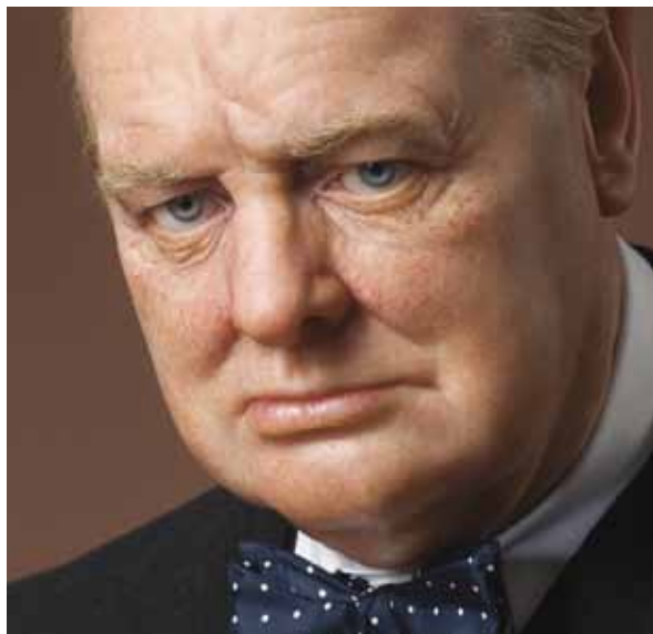
Photograph of Winston Churchill.

OCR is marshalling the troops to throw open the strongholds and reveal some surprising truths about Winston Churchill – and it's all in the name of good history teaching.