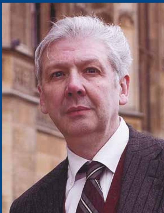
Lord Bew Crossbench, House of Lords.