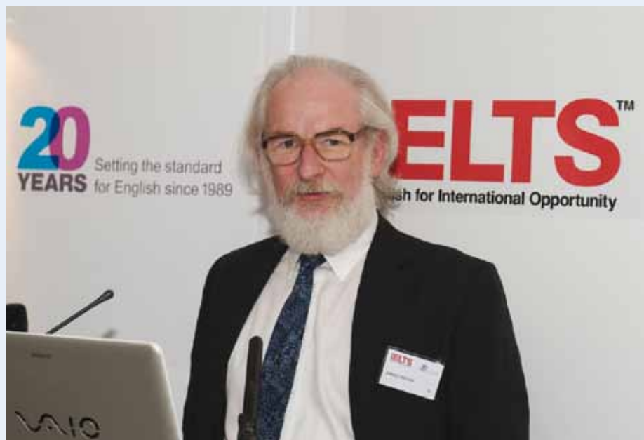
Professor David Crystal speaking at IELTS 20th anniversary.

IELTS is joint-owned by Cambridge ESOL, the British Council and IDP: IELTS Australia – and is trusted by thousands of organisations around the world as a failsafe indicator of English language ability. That means more than 1 million learners each year use IELTS to open doors – changing jobs, studying abroad or migrating – which would otherwise stay shut.