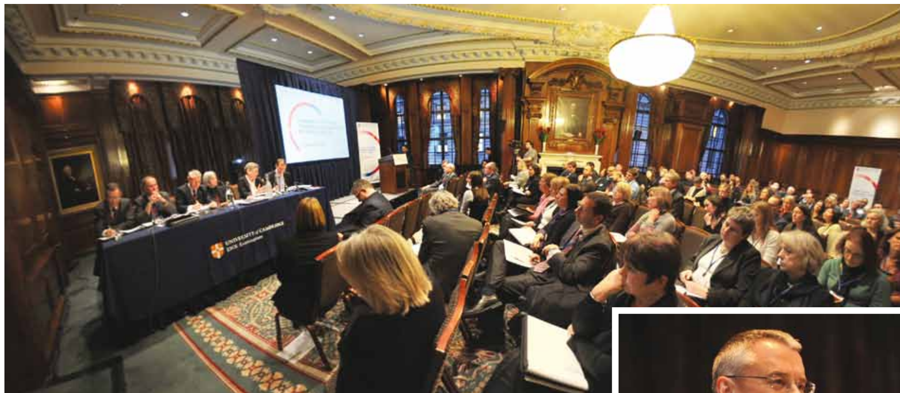
Delegates at the 'Language at the Border' event.

Cambridge ESOL is on top of the immigration agenda, encouraging ministers to ensure the English language requirements for this purpose are fair, effective and secure.