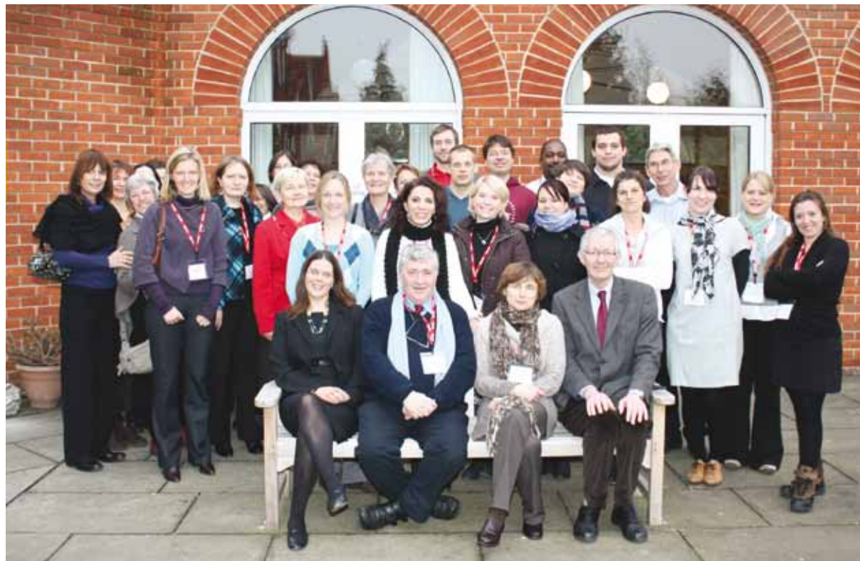
National Research Co-ordinators from around Europe at a training event in Cambridge.

A pioneering European project set to change our understanding of how different people learn languages is now well under way.