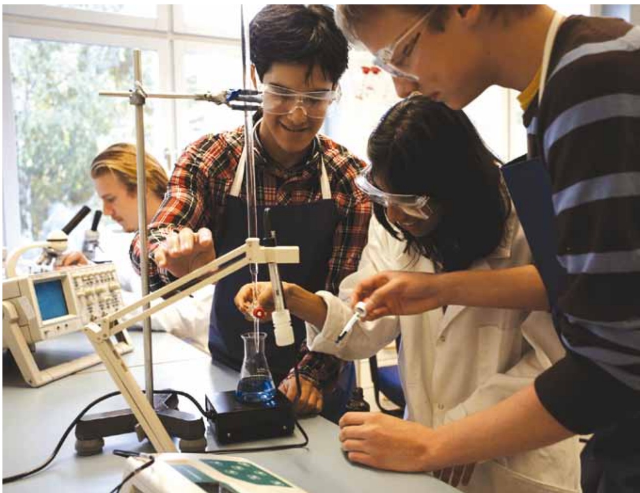
Cambridge IGCSE students from the Internationella Engelska Gymnasiet in Stockholm.