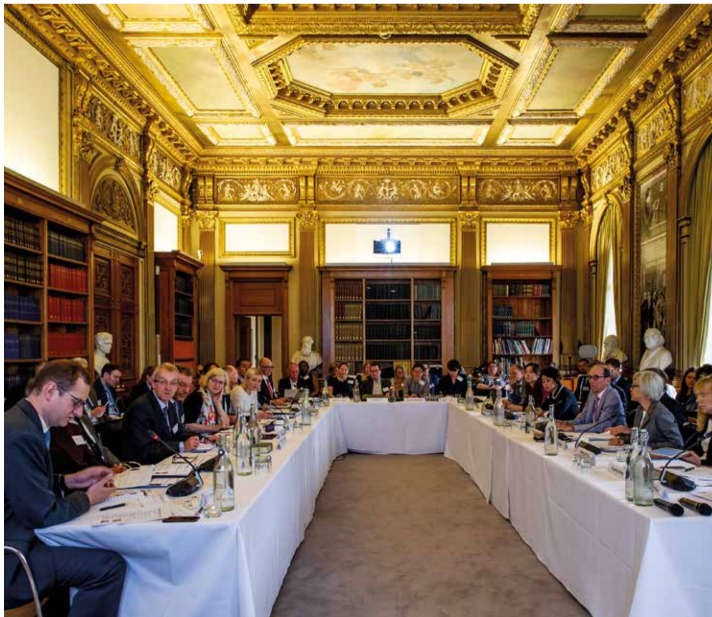
Representatives from 16 countries gather at the Royal Society.