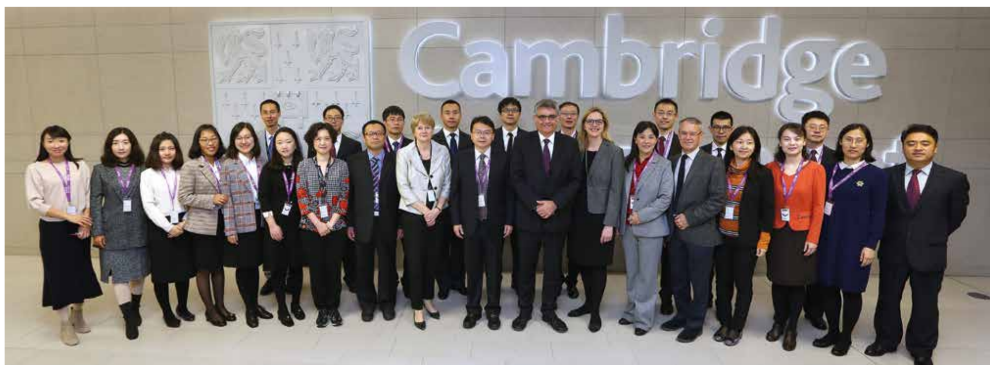
Representatives from China's National Education Examinations Authority pictured with people from Cambridge Assessment English and Cambridge Assessment.