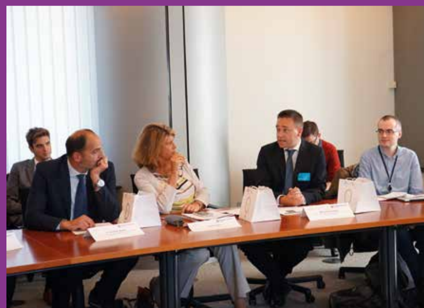
The Association of Language Testers in Europe and Cambridge Assessment English event at the European Parliament to celebrate the European Day of Languages.