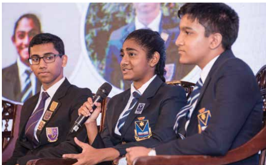
Students from Cambridge schools in Sri Lanka took part in a panel discussion at the conference.

She said: "It was an extremely enriching experience. Apart from the academic learning that takes place at the conference, the sharing of thoughts and ideas among people from diverse social and cultural backgrounds stands out. This will help teachers to develop students as global citizens."