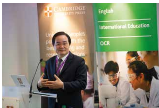
Prof Dr Phùng Xuân Nhạ, Vietnam's Minister of Education and Training.

Prof Dr Phùng Xuân Nhạ, Vietnam's Minister of Education and Training, visited Cambridge with a delegation of leading Vietnamese universities, schools and education